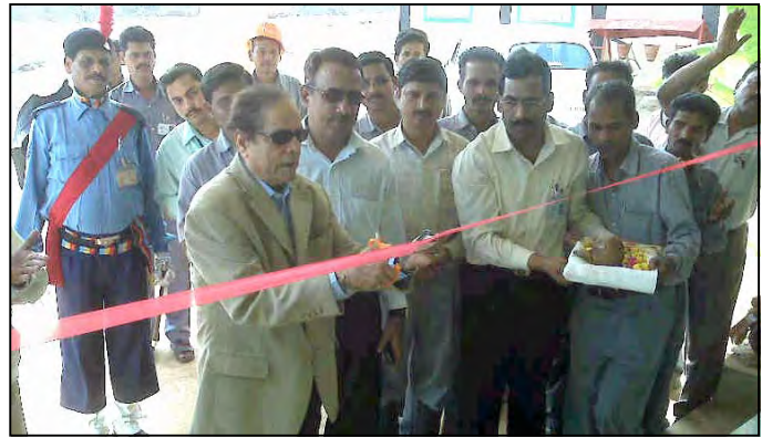
Chairman inaugurating the New Administrative Building.