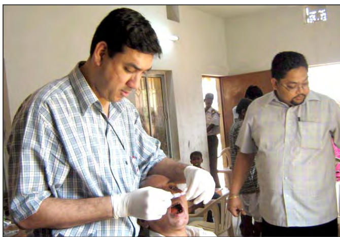
Dental Camp at Bidyadharpur in progress.

Drinking Water Provision: Tube wells were repaired at Hadgarh, Bangore & K Balipal GP to solve the drinking water problem in the summer.