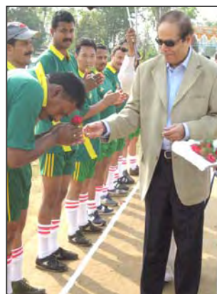
Chairman with the players Therubali in a thrilling final.