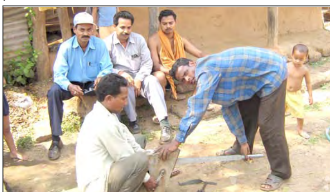
Repairing of Tube Wells in progress.

Drinking Water Provision: Tube wells were repaired at Hadgarh, Bangore & K Balipal GP to solve the drinking water problem in the summer.