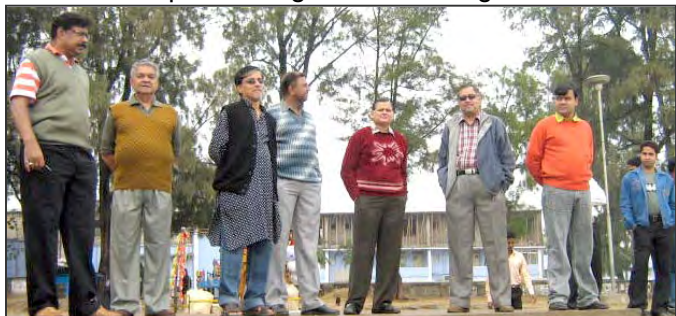
The picnic party at Chandipur.