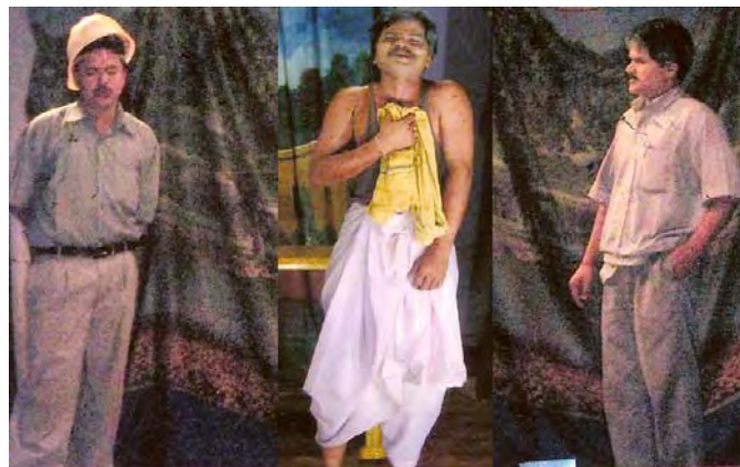
A scene from Safety Drama 'Niraba Ghatak'

People always come into your life for a reason, a season and a lifetime. When you figure out which it is, you know exactly what to do.