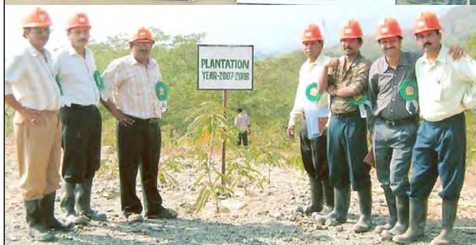
Top: Inauguration of MEMC Week Middle: Members of Inspection Team Bottom: Plantation on occasion of MEMC Week