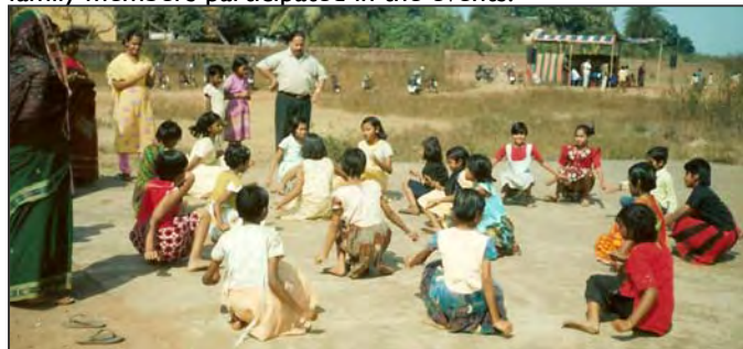
Annual sports in progress...