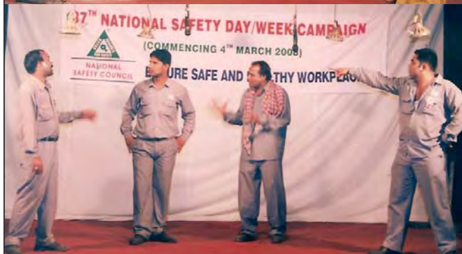
Glimpses from Safety Day celebrations.