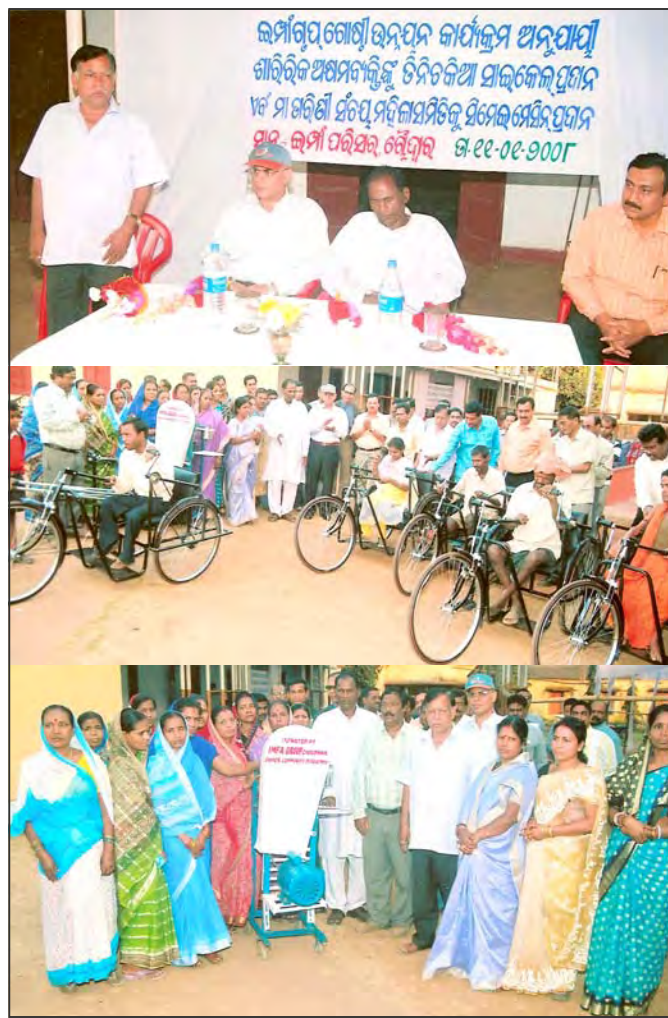
Distribution of Tricycles (middle) & Sevia Machine at CDR.

"Our most basic common link is that we all inhabit this small planet. We all breathe the same air. We all cherish our children's future. And we are all mortal."