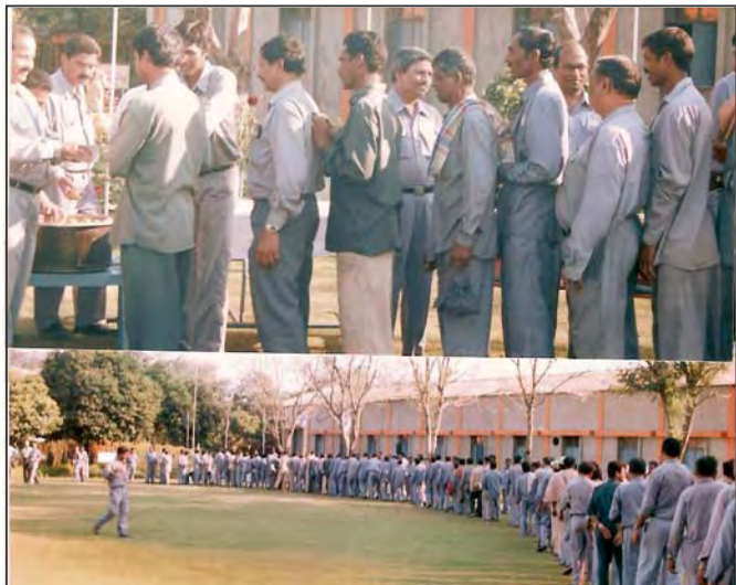
Employees at New Year Get-together

On the occasion of New Year 2008, a Get-together was organized at 3.00 PM in front of Administrative Building. The employees greeted each other and exchanged New Year wish followed by sweets distribution.