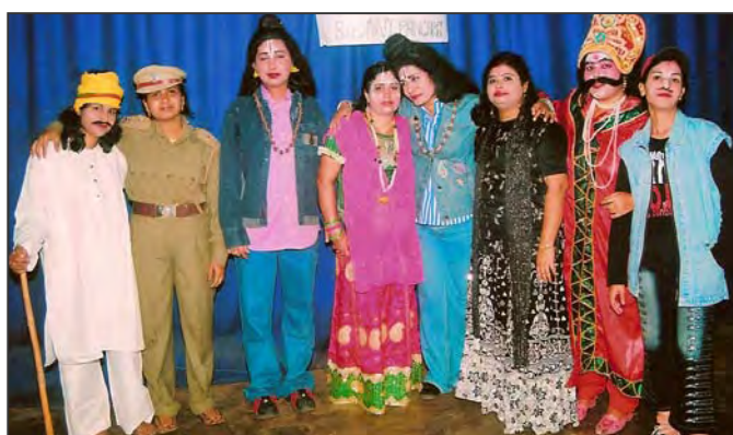
Performers of Drama 'Adhunika Ramayana'

On the occasion of Basanta Panchami, Ladies Club of Colony No.I celebrated Saraswati Puja on 11.02.2008 at the Staff Club. The employees along with their family members offered Pushpanjali to the Goddess of Learning. The evening with live dance to the tunes of recorded music, songs & comic drama "Adhunika Ramayana" kept the audience glued to their seats. The Youth wing of Colony No.II also celebrated Saraswati Puja in the colony.