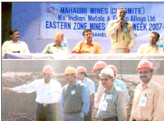
Top: MEMC Week at Mahagiri