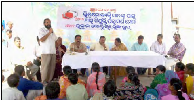
Single Window Camp in progress.

Utkal Coal Ltd. of IMFA Group organised a Single Window Camp for differently abled persons on 14.01.2008 at Angul.