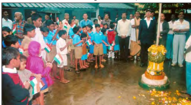
Republic Day celebration at Recreation Club