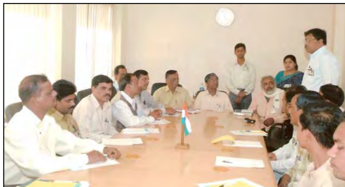
Training program on ESI in progress.