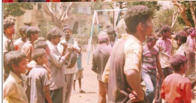
Scenes from Holi celebrations