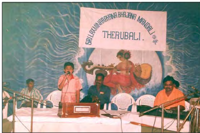
A scene from Bhajan program.

"Maha Sibaratri" was celebrated at Laxmi Narayan Temple with much devotion on 16.02.2008. Devotees from far and near villages came to the Temple for worshipping. At midnight 'Mahadeepa' was lifted for darshan of devotees. A Bhajan program was presented by local artists on this occasion.