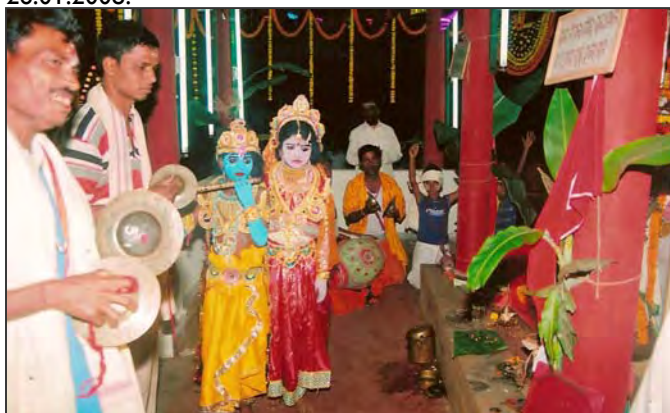
A scene from Astaprahari Nama Yagna

The annual Astaprahari Nama Yagna & Kirtan program was organised in Champakeswar Temple from 24th to 26th Jan'08. The Kirtan Mandali and the employees went around on a Sankirtana Parikrama inside IMFA, UMSL and both colonies on 26.01.2008.