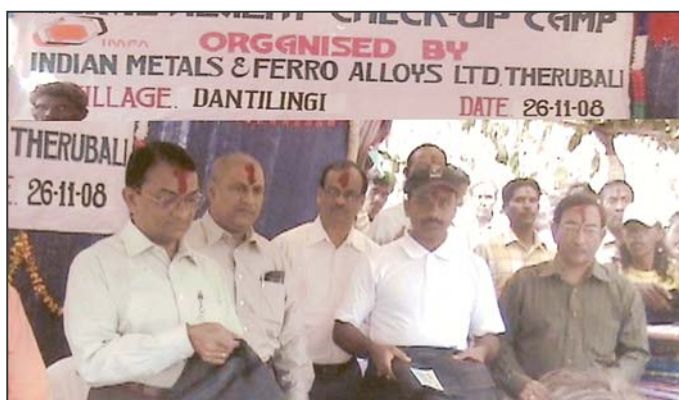
A scene from the Healthcamp.