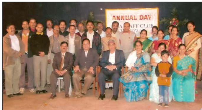
Outgoing & incoming office bearers of IMFA Staff Club .