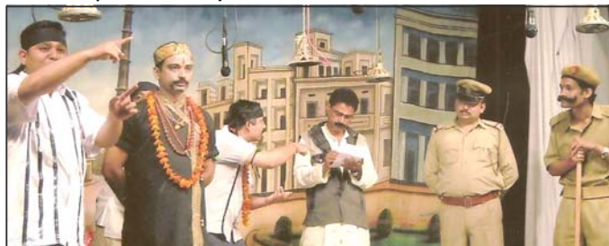
A scene from the drama 'Amari Naa Re Ame Nauri'

IMFA Club organised a Drama "Amari Naa Re Ame Nauri" on 15.11.08 performed by the club members.