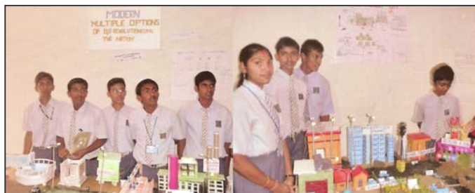
Chinmaya Vidyalaya students with their projects.