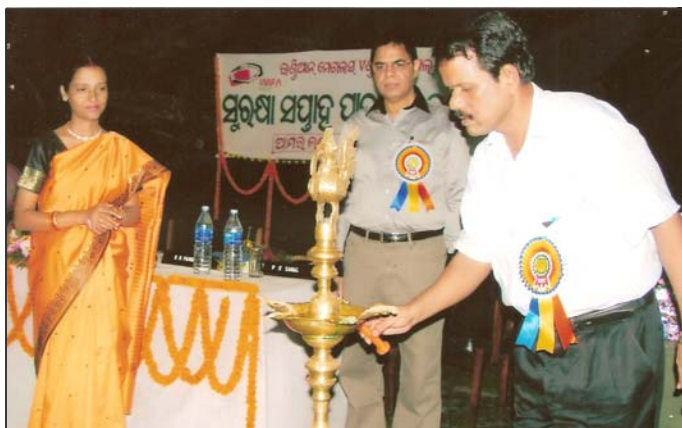
Chief Guest inaugurating the Closing day function.