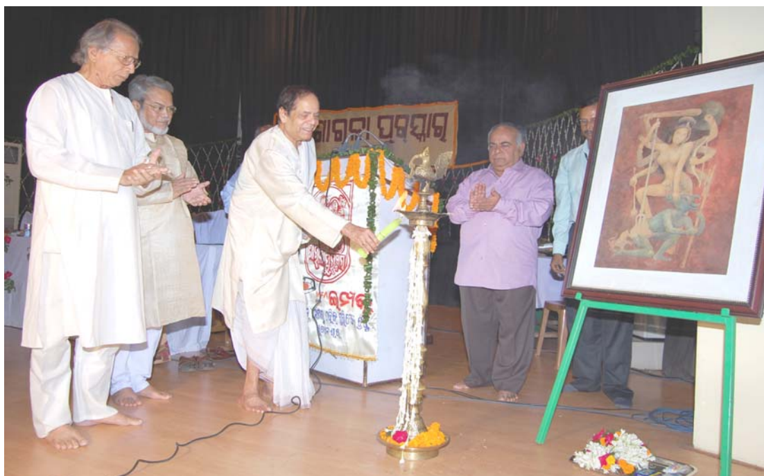
30 th Sarala Award function begins with lighting of lamp by Chairman before Goddess Sarala on 14.06.2009 at Jayadev Bhawan, Bhubaneswar.