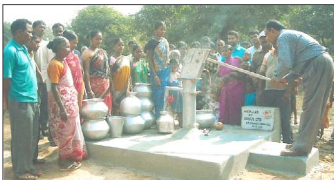
Tube well at Kamalbahali village.

Drinking water provision has been made with tube wells installed at Kamalbahali village under Danagadi Block on 08.12.08. Under Jalachhaya Program, drinking water is being offered to the general public since 26.03.09.